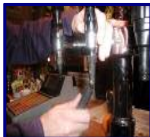
12. Fit hose to tap.