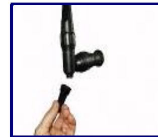
10. Remove any restricted nozzles.