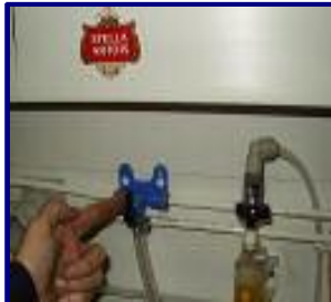
2. Switch the Gas OFF to the product.