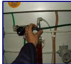
8. Vent/bleed FoB to remove all gas.