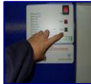
9. Press 'CLEAN'.