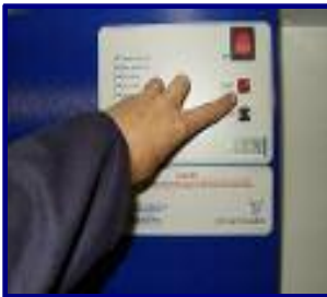
7. Switch ON & press START only.