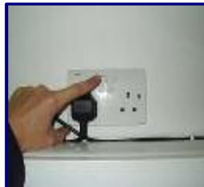
3. Turn any pump assist units OFF (If fitted).