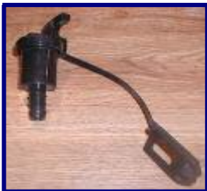
11. Fit HIT adaptor. (If fitted)