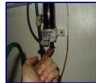
5. Put the FoB in to 'CLEAN' mode.