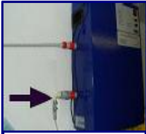
6. Check correct ring-main feed is connected.