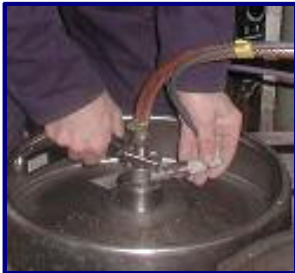
1. Disconnect coupler from the keg.

E: help@phoenixabc.co.uk W: www.phoenixabc.co.uk