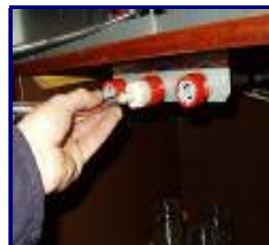
13. Fit hose to waste.