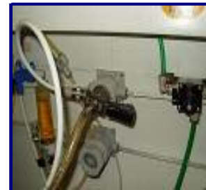
4. Connect to the cleaning socket.