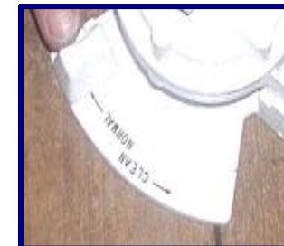
15. Open check valve. (For CASK cleaning)